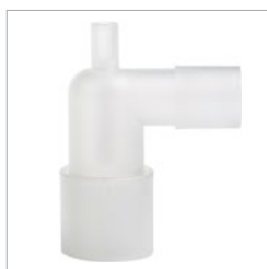
90 deg Elbow Connector with CO 2 Port