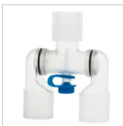
Main body for Adult Swivel Y